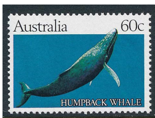
17. 1982 60c HUMPBACK WHALE trial printing with solid blue-green background BW 930 E(1) MUH SG 841a Cat. £250, nice buying..... $199.00