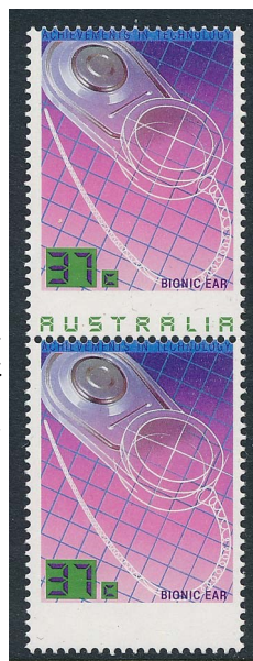
20. 1987 37c BIONIC EAR BW 1224ba, a vertical pair from the bottom two rows of the sheet, misplaced 5mm down, Australia at base on the upper stamp and omitted on the lower stamp, mint unhinged vertical pair..... $449.00