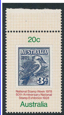
16. 1978 20c NATIONAL STAMP WEEK BW SG 694(var)/ACSC 823PP (2) 1978 20c National Stamp Week. Printed on non-helicon paper. Comes from the only recorded printers proof sheet of 50 stamps. with Ceremuga Certificate just..... $199.00