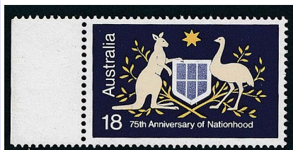
14. 1976 18c NATIONHOOD SG 614b type A, gold on both the star and crown are missing, lovely Mint Un-hinged..... $349.00