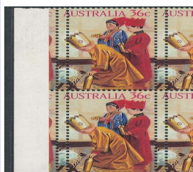
18. 1986 CHRISTMAS SG 1041 36c horizontal block 12 - 6 x 2, showing double vertical perforations on the two columns at left (reduced scan) nice block MUH for..... $199.00