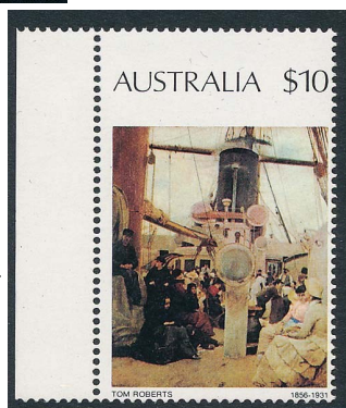
15. 1977 $10 COMING SOUTH BW 784ba with Australia at the top instead of the base, mint unhinged, a lovely looking variety for a great price..... $275.00