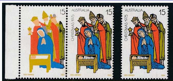
13. 1975 15c CHRISTMAS BW 730cb showing black partially omitted on the two units, attractive pair un-hinged mint for..... $749.00