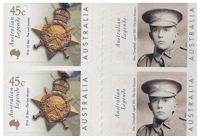
22. AUSTRALIAN LEGENDS 2000 Booklet BW 2280c showing the two units of Alec Campbell missing, one of only 16 booklets found at the time, rare..... $749.00